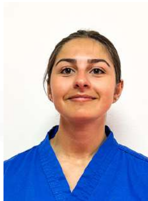
Olivia Ladogana Press Office